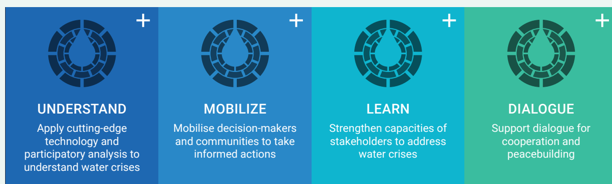
Figure 2. The Water, Peace, and Security Process

Somalia, Ethiopia, South Sudan, and Cameroon. 60 The data analysis lays the foundation for identifying the most pressing risks, but it is only the first step of the partnership’s work. The WPS partnership builds on its data tool in order to implement adaptation action through a four-step process: understand, mobilize, learn, and dialogue.