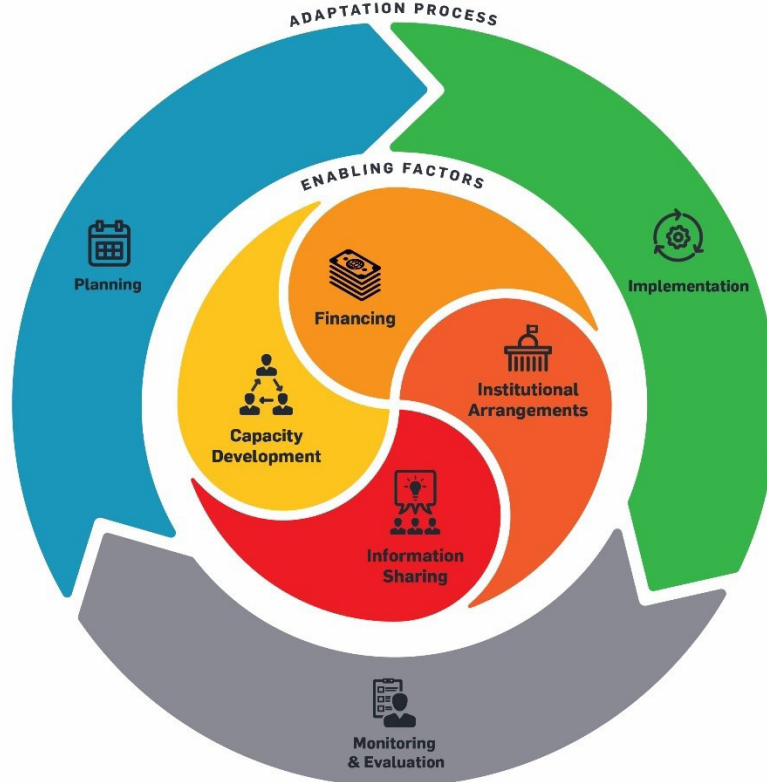
FIGURE 1 The adaptation process and its enabling factors