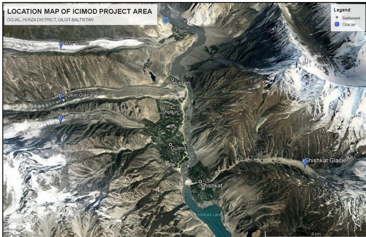
Location map of ICIMOD project area